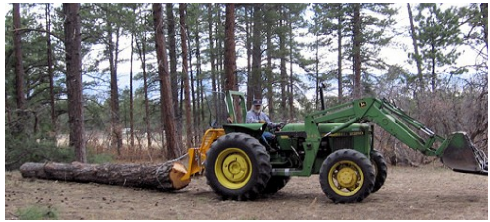
Representative of the mid-sized equipment is this 60 h.p. John Deere tractor with a mid-sized Uniforest brand winch, model 40E. This winch ships with 230' of 7/16" wire rope with a 8800 pound pulling capacity. This combination can handle large diameter logs in long lengths.