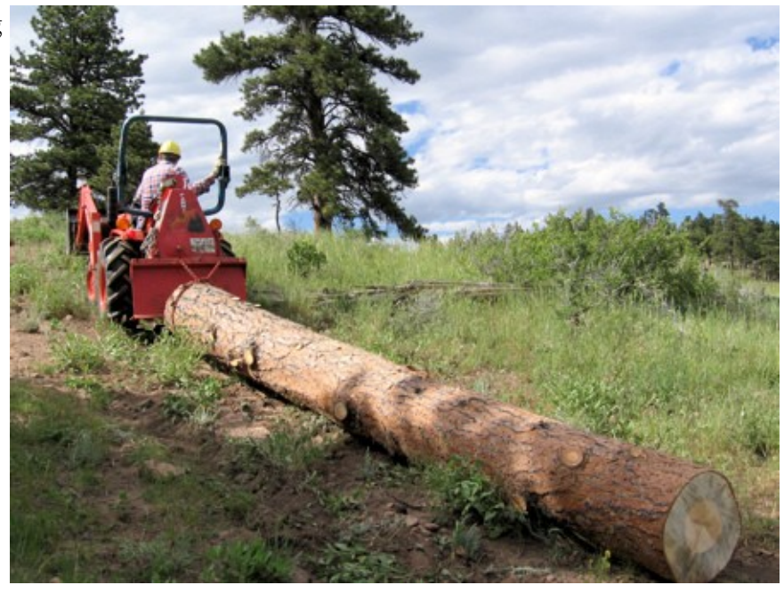
This small tractor is capable of pulling this load uphill.

The log shown here is about the maximum weight that this equipment can skid while keeping the front end of the log off the ground. This is essential to minimize soil disturbance and rutting that can cause erosion.